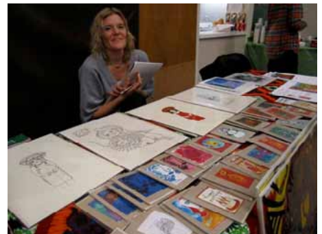
Crafters displaying their handiwork at the November 25th Craft Fair.