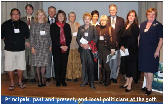
Principals, past and present, and local politicians at the 50th

It has now been just over one year that I have been Principal of Garden Avenue School and what a year it has been! From the dunk tank to the 50 th Anniversary celebrations, there are countless memories to cherish! (I was hoping one time in the dunk tank would be memory enough but I hear plans are afoot...)