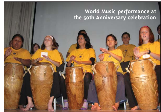
World Music performance at the 50th Anniversary celebration

Garden's staff continues to work together towards our priorities. We have plans in place around numeracy, literacy, equity, arts, and information technology, with special interest in programs like Safe Schools, EcoSchools and Toronto Schools on the Move. Currently, staff have organized chess, drawing and homework clubs, choirs, primary floor hockey league, Forest of Reading activities and the Playground Ambassadors program.