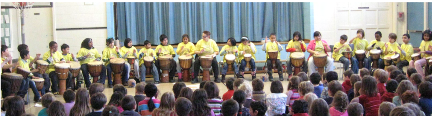
The Gateway Public School Drummers perform for Garden students.